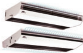
Single and exclusive dual discharge evaporators