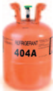
X 4 Series

35% to 50% higher BTU-per- gallon efficiency.