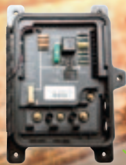
Power Control Module