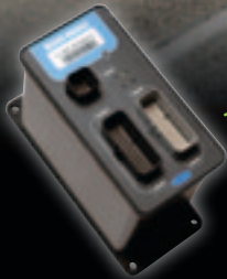
Main Micro Module