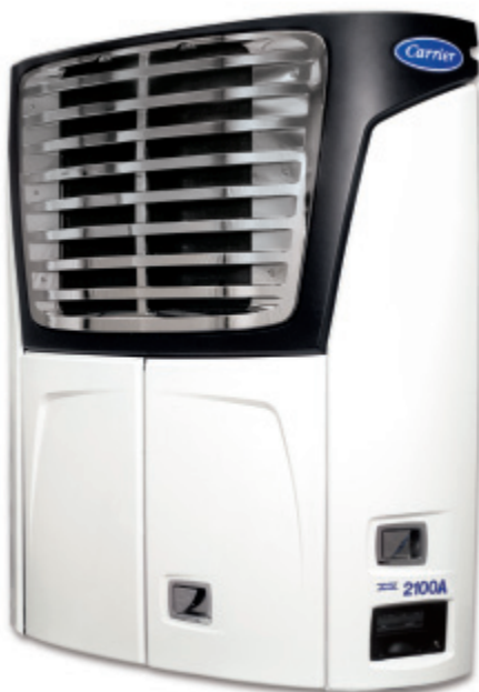
2100A shown with chrome grille/stainless latch option