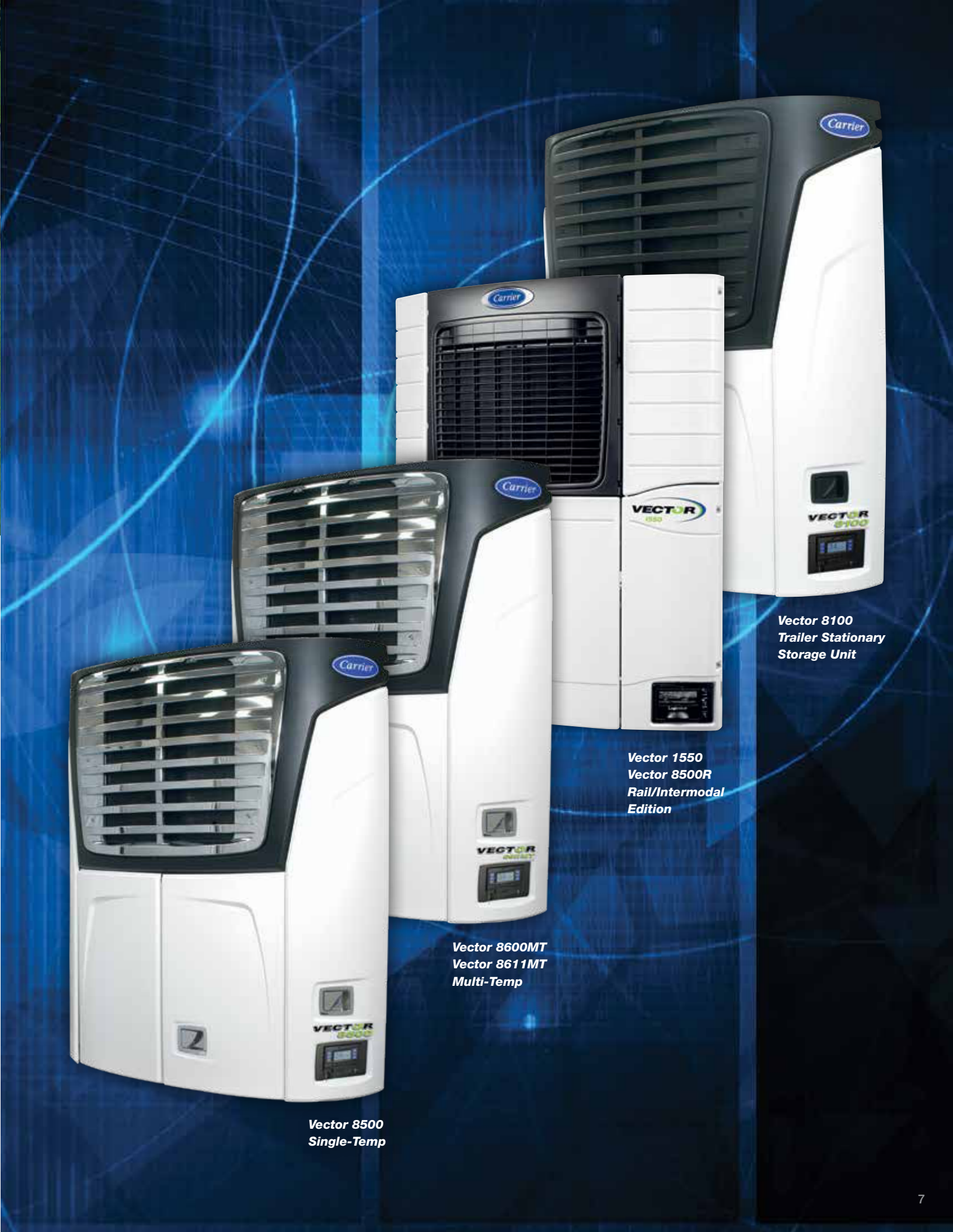
Vector 8100 Trailer Stationary Storage Unit

Performance data compared to the Carrier Transicold models they replace and dependent on a range of operational settings, environmental conditions and model type.